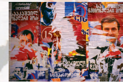
The mood in Tbilisi after the "Rose Revolution"

level. IFES' civic education efforts led to the creation of student councils and Parent-Teacher Associations in 20 pilot schools, which provided students with important lessons on civic responsibility and community involvement.